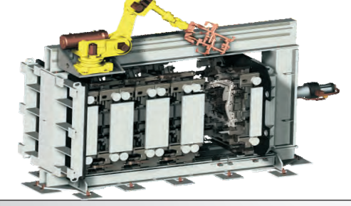
Shelf mounted robot